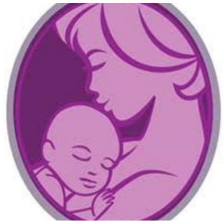
Maternal health is a public health issue

Information is being gathered in relation to priority public health concerns, challenges, delivery of services, current state policies, budgetary issuers, and various sources of funding. This information will be a component of the final testimony provided by the League as part of the winning university bidder's collection of information from the public. We will continue to keep you advised of the progress of the study, results of the study and the future of a Public Health Department in Delaware County.